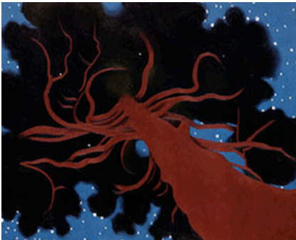
The Lawrence Tree and Black Mesa Landscape, by Georgia O'Keefe

Sociocultural note related to the title: Georgia O'Keefe was one of the most impressive US American artists who moved out to the desert to paint.